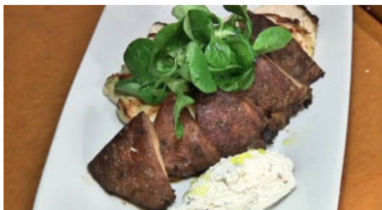
A locavore's delight. Grilled chicken with portabella mushrooms, local ricotta and lamb's lettuce at Rathbun's Blue Plate Kitchen. KXAS

Living a green lifestyle isn't just about recycling or giving up that sport utility vehicle for a hybrid; it can also come down to the dinner table.